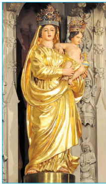
The statue of Our Lady under the title of Our Lady of Prompt Succor came to New Orleans in 1810. Over the following two centuries, the Ursuline Sisters have shared this devotion to Our Lady of "Quick Help" with many who pray to the Mother of God in moments of pain or need, joy or thanksgiving, or simply out of desire to live their lives with deepening fidelity and love.

As employees and supporters of the good work of Catholic Charities, it is important that we remember why it is that we continue this work. Celebrating Mother's Day reminds us of the hope and faith that Mary held in her heart even during her darkest hours following the death of her son. This faith she held until the resurrection of her son renewed all life in this world. We must continue to hope and strive for a better future for all our brothers and sisters in Christ.